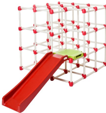
Product Name: Lil Monkey Climb N' Slide CUBE